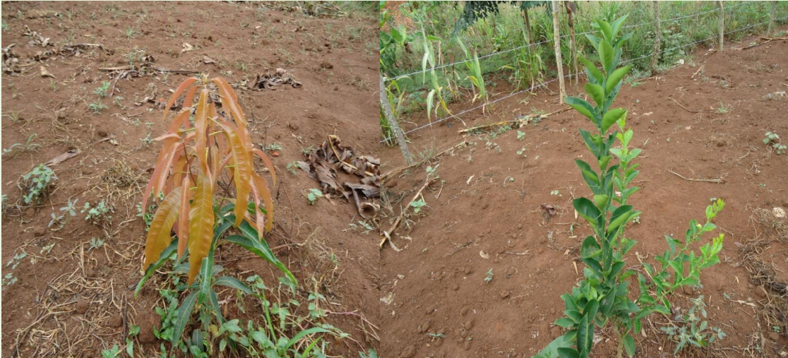
Mango fruit tree