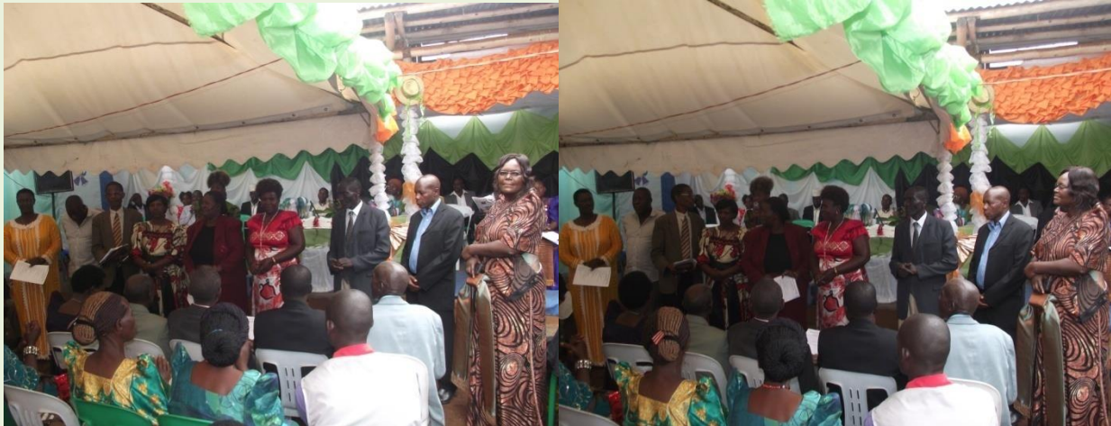
Board of committee members for Maama Shamilah School of beauty standing up for recognition before the parents