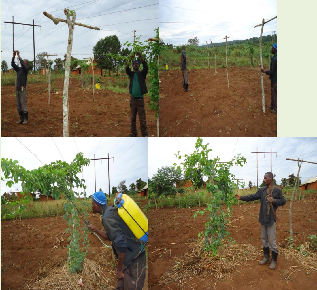
Some of the members working on the model farm