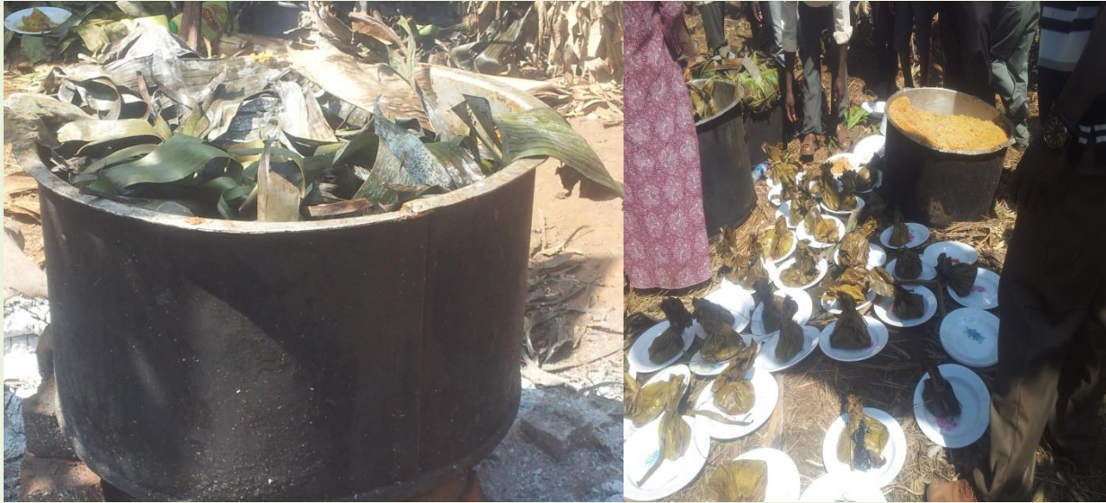
Kabuswaga Youth Women Group's sauce pan hired on some function

As KAP officials, we found out that this group put at good use the initial capital they received from KAP and they are really progressing.