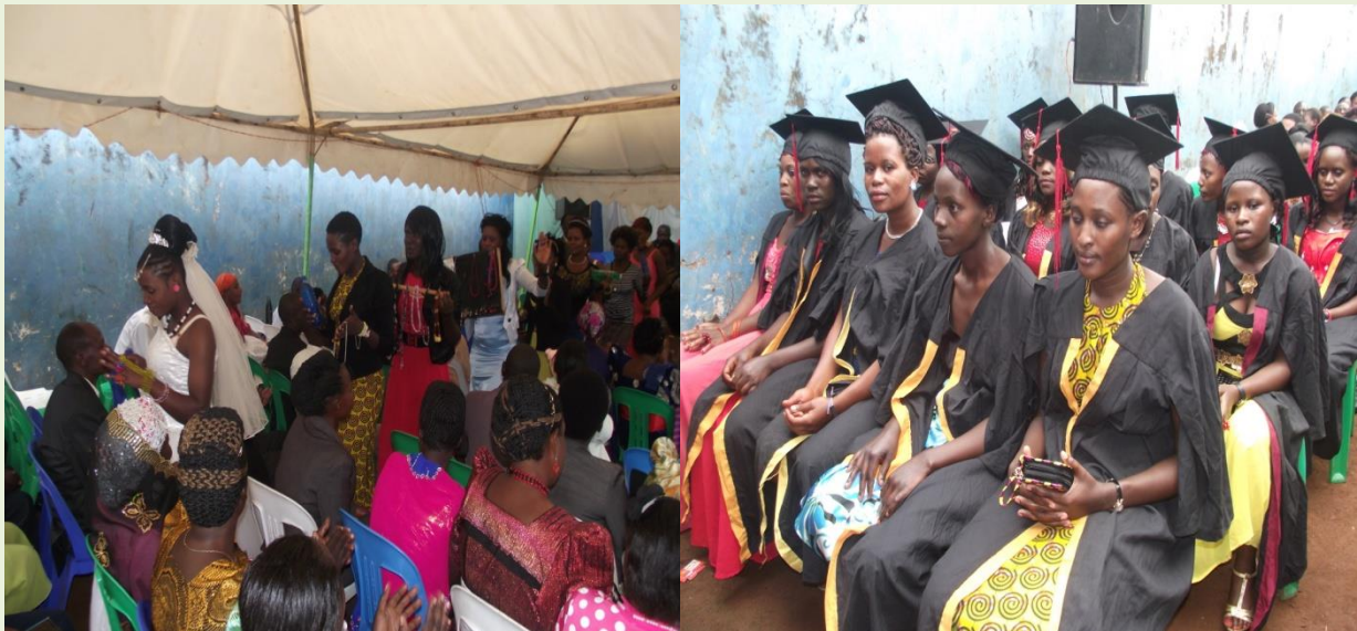
Some of the KAP female beneficiaries graduate off the beauty school