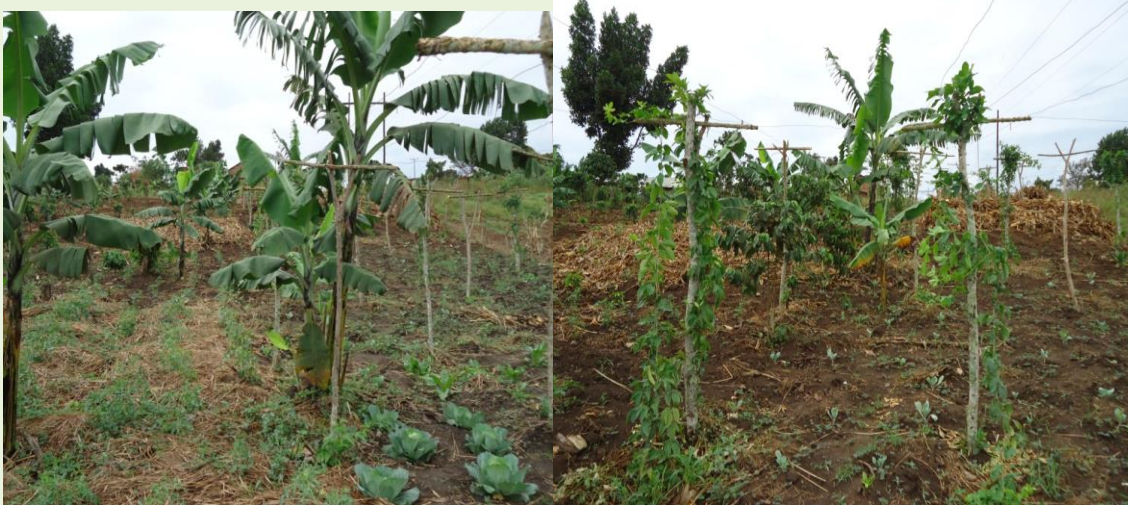
Bananas grown on the model farm